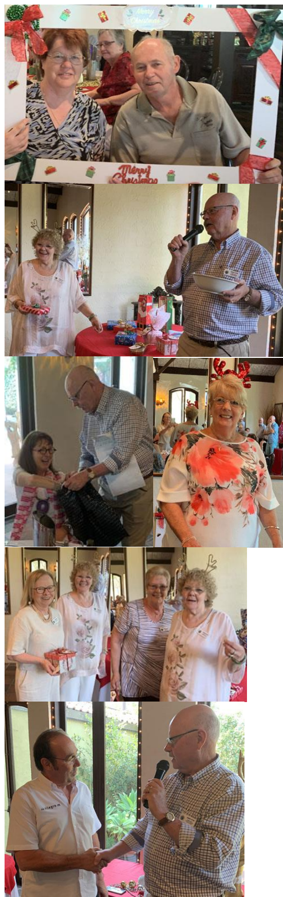
Thank you, Allegro Restaurant.