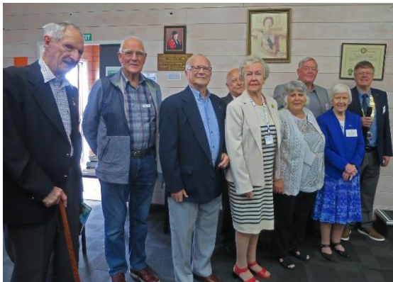
Pictured above: Probus Club of Kapiti Coast Past Presidents.

At the monthly meeting on Thursday, 31 October, the date closest to its founding, The Probus Club of Kapiti Coast Inc. celebrated 45 years in Probus.