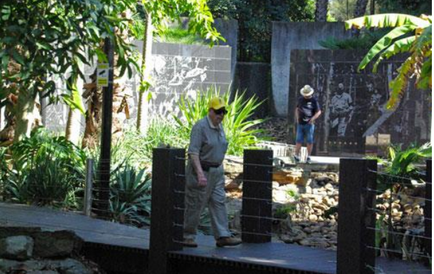
The Memorial Centrepiece. Images taken by photographer Damien Parer during the New Guinea Campaign have been sand blasted onto granite walls.